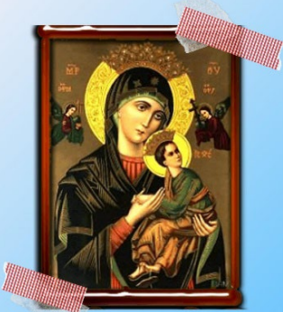
OUR LADY OF PERPETUAL HELP

Friday June 27 th is the feast of Our Mother of Perpetual Help , which the Redemptorists have special role in promoting devotion to. You can join the Novena in Belfast online each day at www.clonard.com